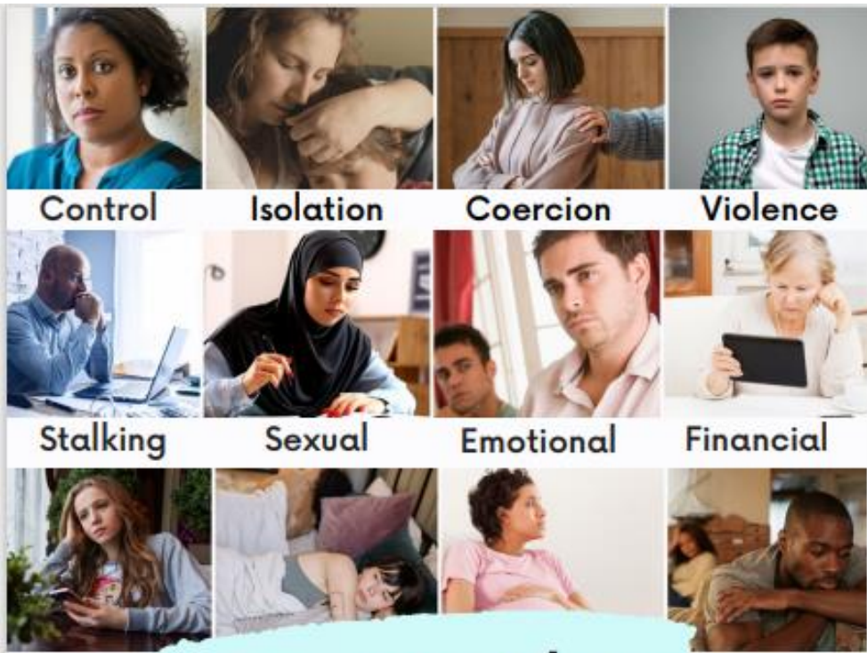
Control Isolation Coercion Violence