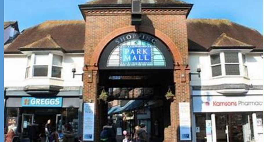
Park Mall Shopping Centre – An £825k purchase to enable regeneration of an old shopping centre and help revitalise Ashford' town centre