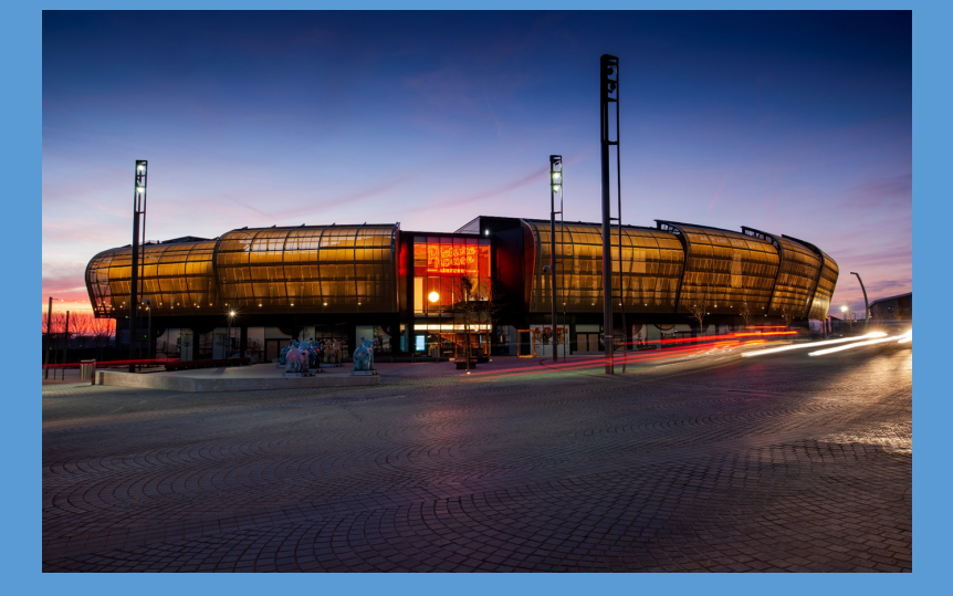
Elwick Place – A £42m investment to drive the night time economy, regenerate a central town location and deliver a leisure destination