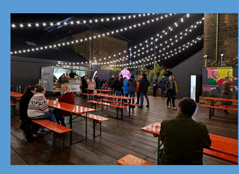
Coachworks – a redevelopment of buildings to support the delivery of the Commercial Quarter consisting of shared working and bar