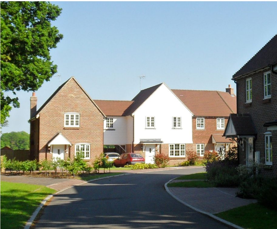
RACE is working with parish councils and others in the housing sector to deliver rural housing schemes such as these at Smarden, which were delivered in partnership with English Rural housing association.