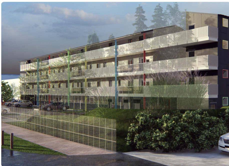
Below: Ashford's Henwood TA scheme

A presentation on Home Straight, a service to help people who hoard, created lively debate covering when a safeguarding referral should be made and the rise in mental health issues leading to more hoarding. The HHSC Action Plan concludes in March 2023 and the new plan extending to 2025 will be discussed at the next meeting.